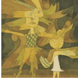
© Paul Klee / Zentrum Paul Klee Bern

The Palace for Fine Arts organises the first monographic exhibition in Belgium since 1948. The oeuvre of Paul Klee is presented in a new and original light corresponding to his vision on the world. The Swiss artists has created an imaginative universe in which the world appears as a large theatre. Music also plays an important role in Paul Klee's universe: this is highlighted with the complex compositions of Pierre Boulez.